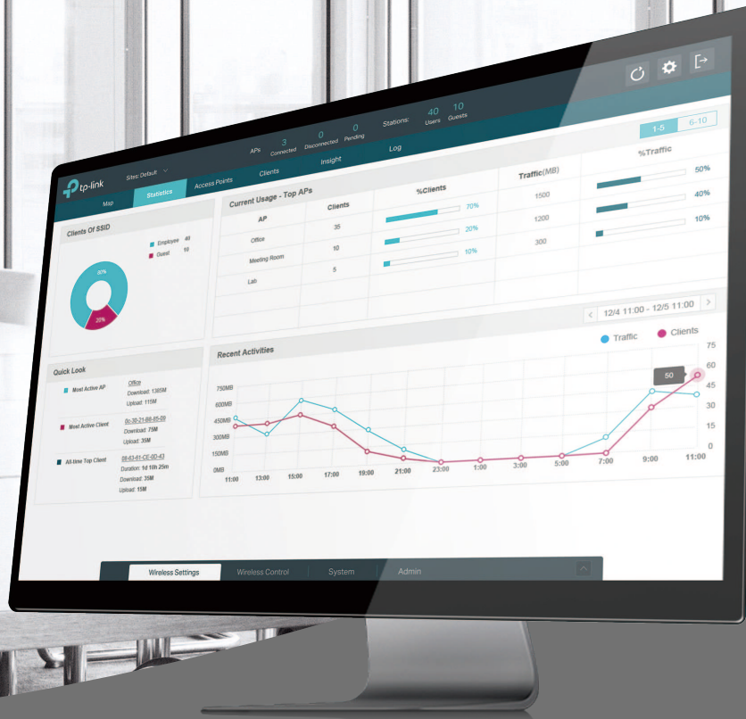
Omada Controller Software

MODELS: EAP330/EAP320/EAP245/EAP225/EAP225-Outdoor EAP115/EAP110/EAP110-Outdoor/EAP115-Wall