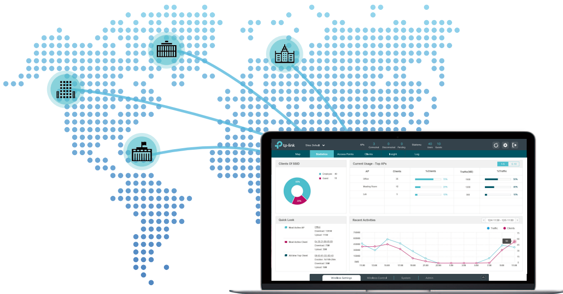
Omada Controller Software