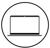
16" HUAWEI FullView Display