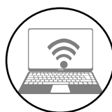
Huawei Metaline Antenna