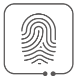
One-touch Fingerprint Power Button