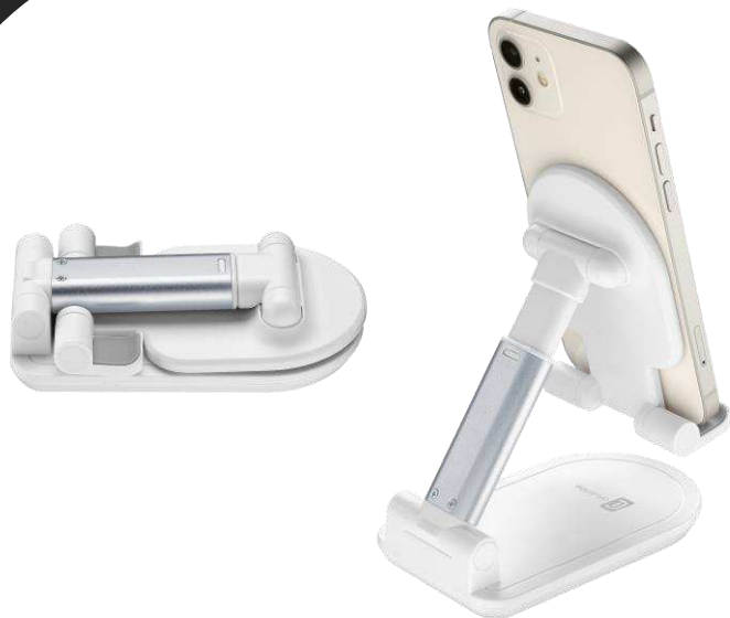
The images are examples of the product but not of the device