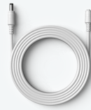
Power Extension Cable