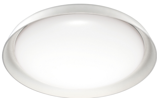
Plate | Decorative ceiling luminaires with WiFi technology