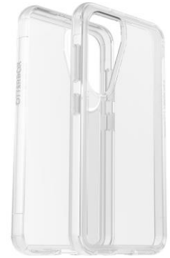
Clear 77-91215 (Retail) 840304713974 77-91216 (ProPack) 840304713981