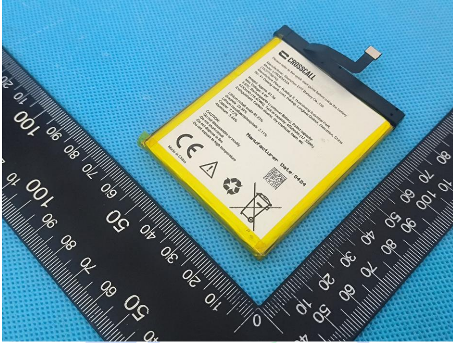
Fig. 1 – Front view of Battery