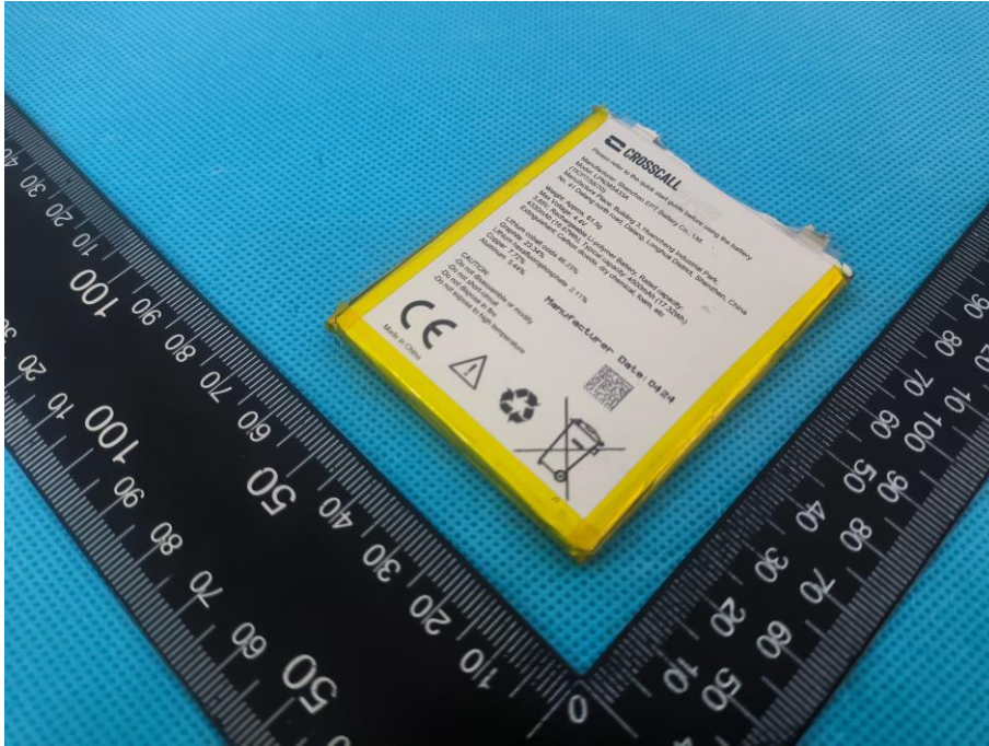
Fig. 3 – Front view of Cell