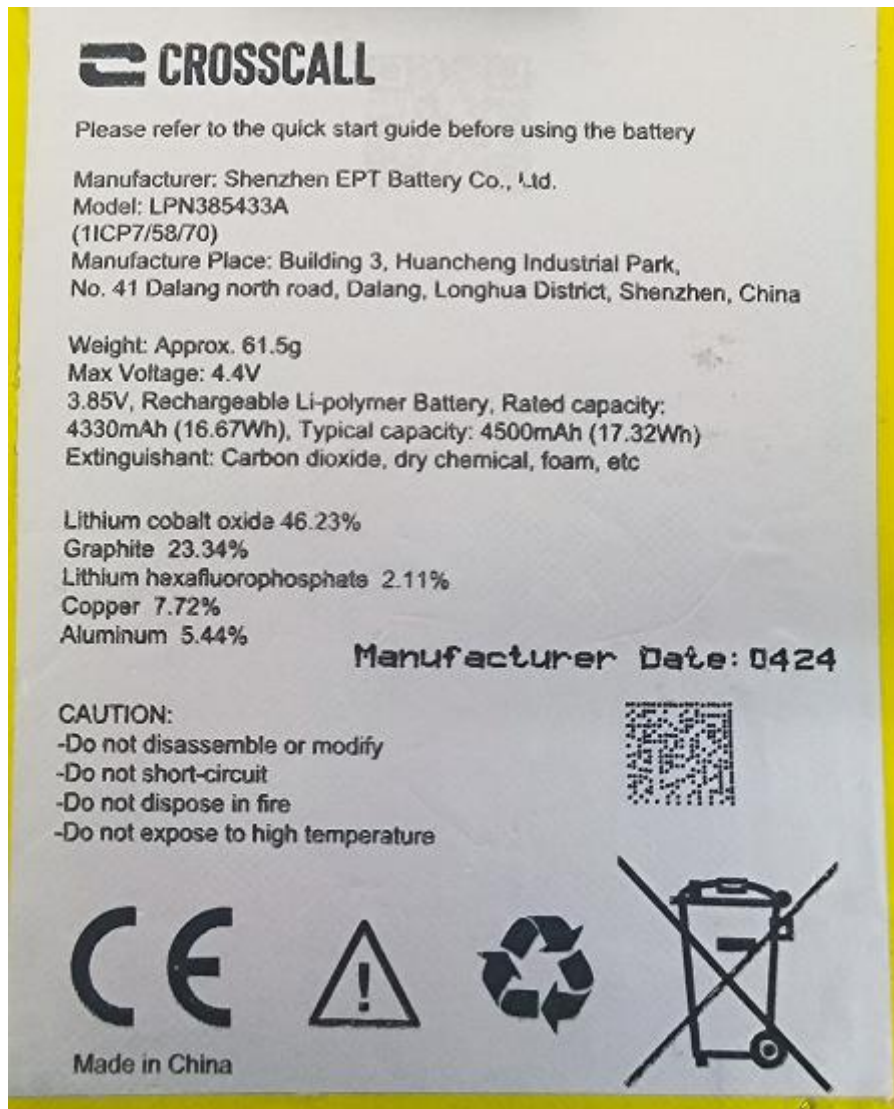
Fig.5 – Label view of Battery