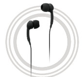
Lenovo 100 In-Ear Headphone