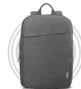
Lenovo 15.6" Laptop Casual Backpack B210