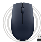
Lenovo 520 Wireless Mouse