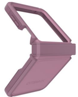
Mulberry Muse 77-94066 (Retail) 840304744756