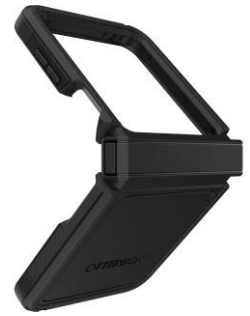
Black 77-94064 (Retail) 840304744732