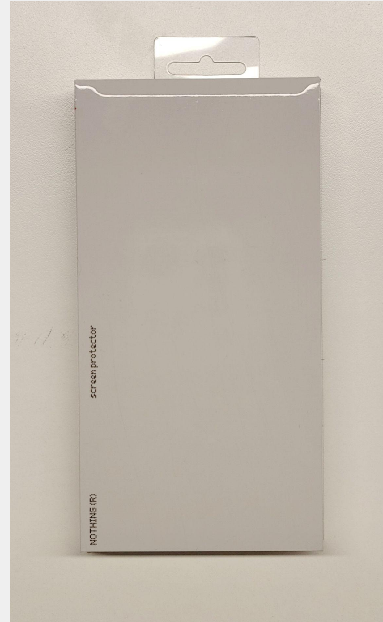
Packaging *Color still being tuning