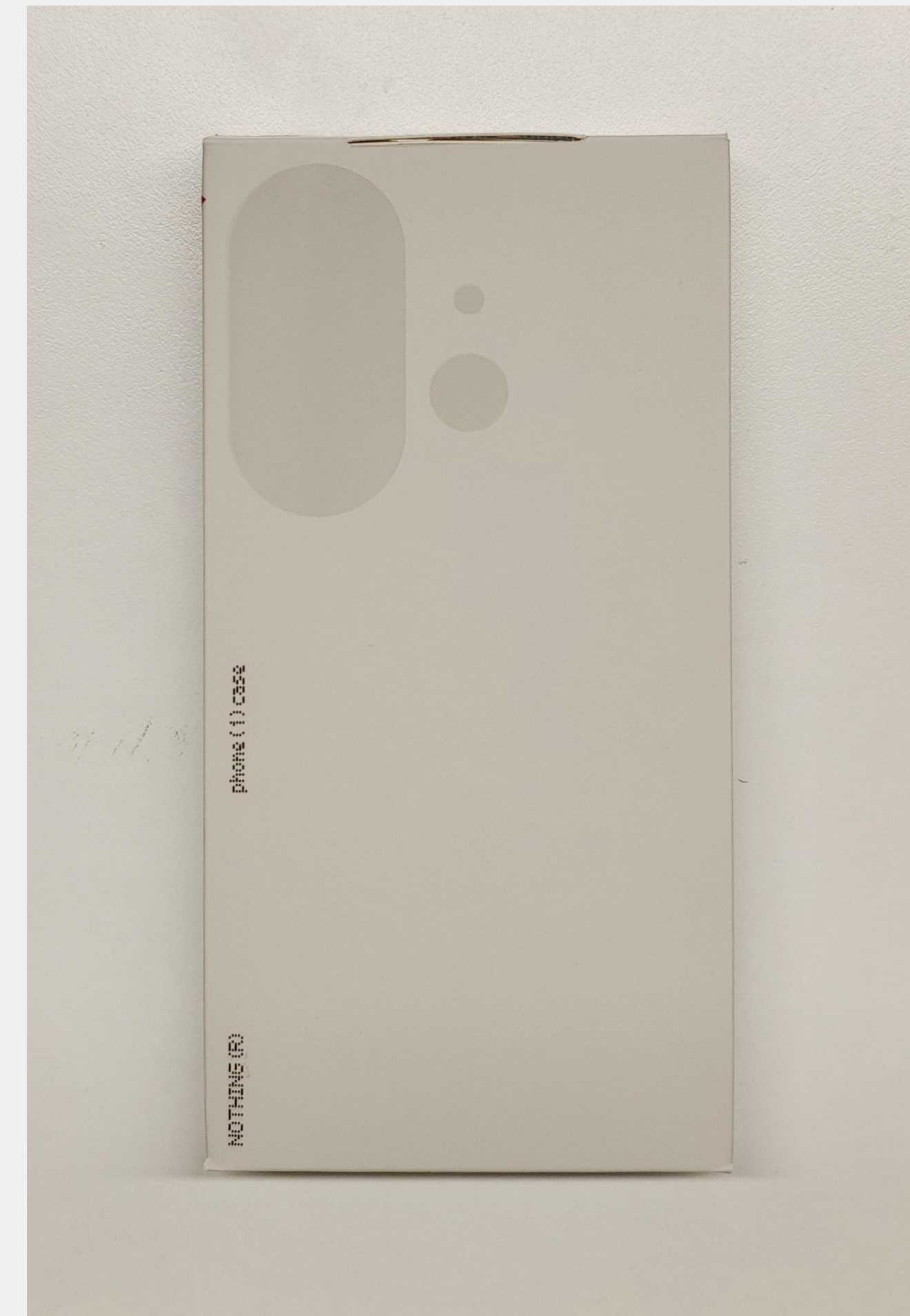
Packaging *Color still being tuning