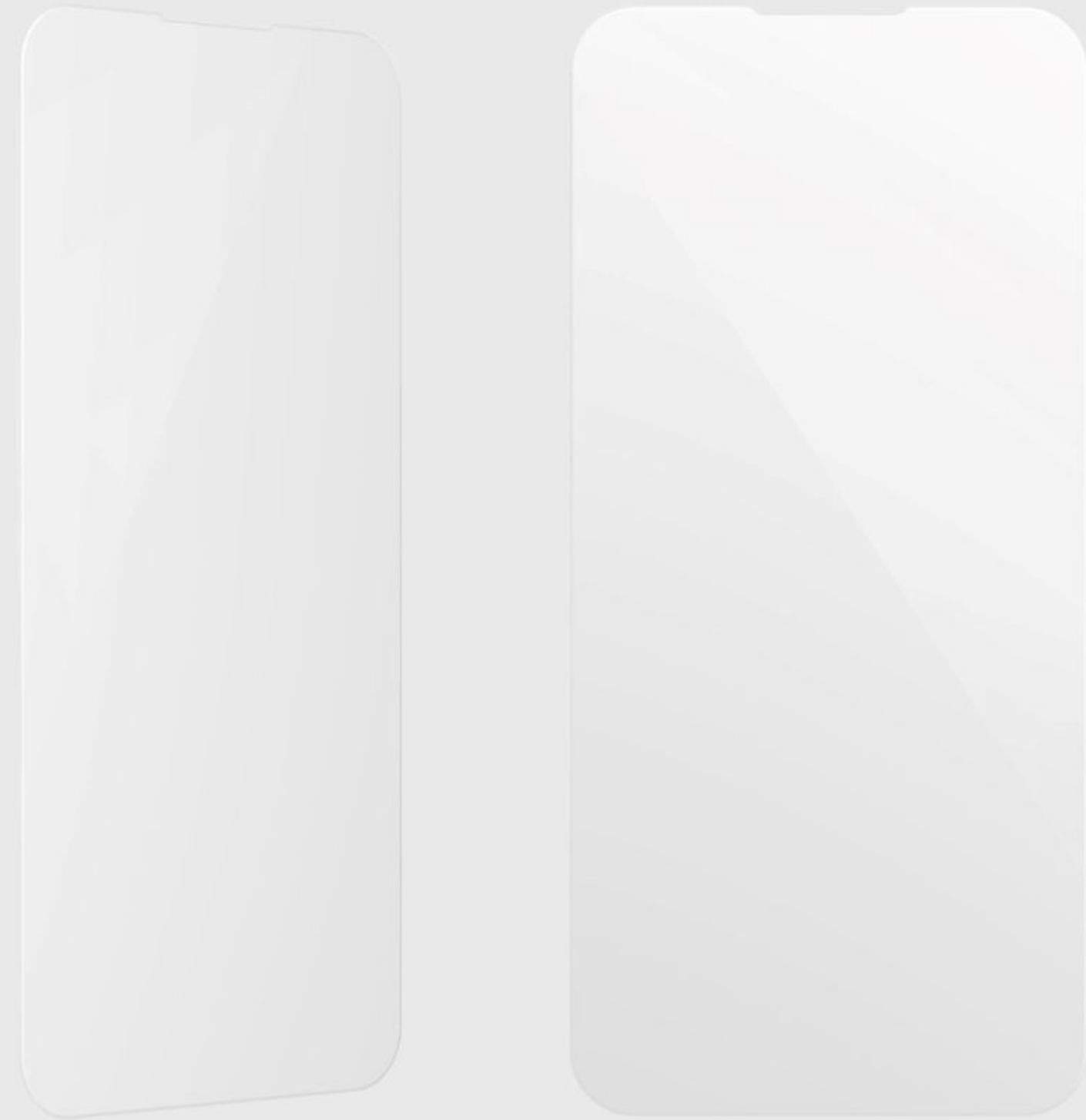
Full transparent glass Render non-final