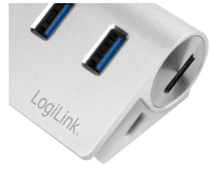
Stylish aluminum design