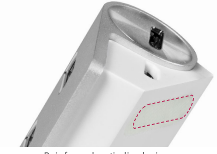
Reinforced anti-slip design