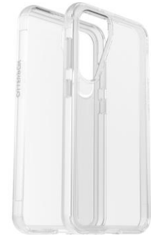
Clear 77-91194 (Retail) 840304713769 77-91195 (ProPack) 840304713776

* Helps protect the case exterior against many common bacteria. It does not protect you or the screen. Active ingredient: silver phosphate glass.