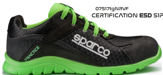
07517tgNRVF CERTIFICATION ESD S1P