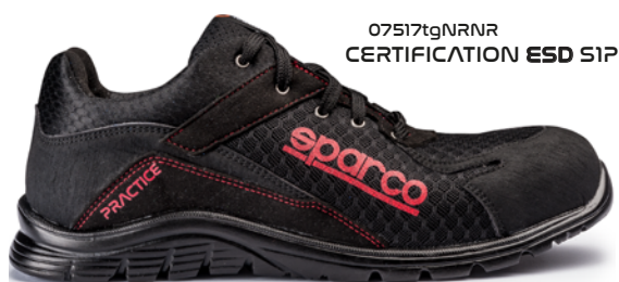
07517tgNRRR CERTIFICATION ESD S1P