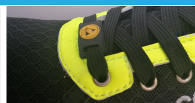
ESD LABEL as rubber laces hook