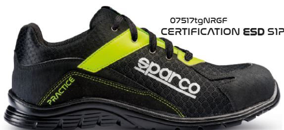
07517tgNRGF CERTIFICATION ESD S1P