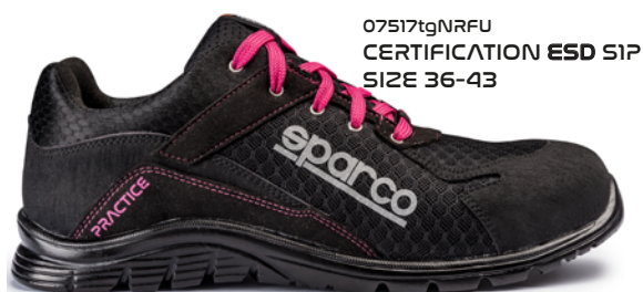
07517tgNRFU CERTIFICATION ESD S1P SIZE 36-43

UPPER: breathable micro-perforated fabric and scratch-resistant microfibre with high abrasion resistance.