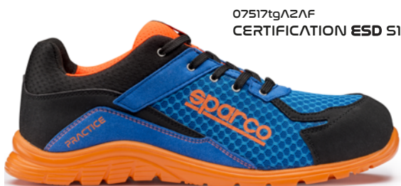
07517tgA2AF CERTIFICATION ESD S1P