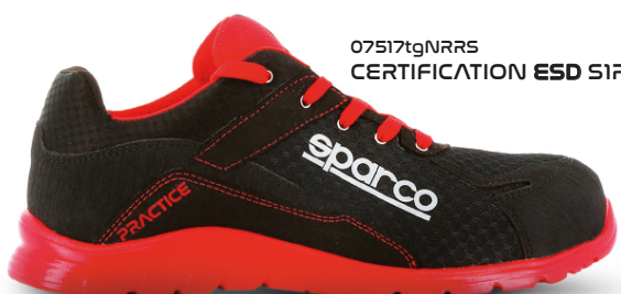
07517tgNRRS CERTIFICATION ESD S1P