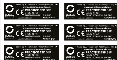
INTERNAL TONGUE LABEL transfer printed inside the tongue Size 50 x 15 mm Code+color per each color version