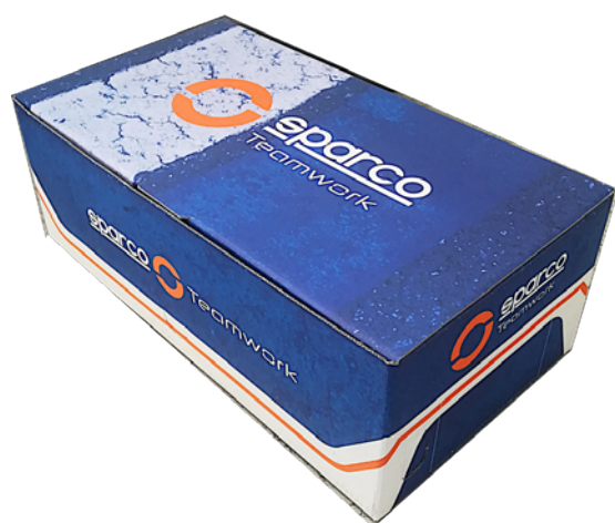
SPARCO TEAMWORK BOX in cardboard blue-white-orange and protective inner tissue paper Dim. 343x188x123 mm