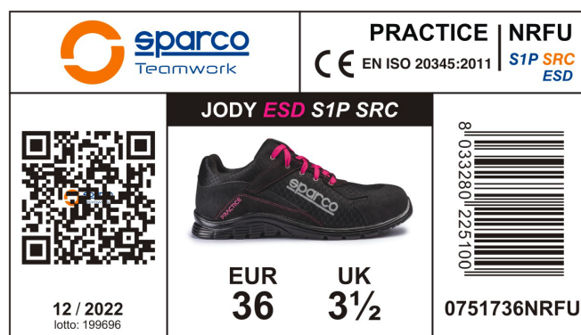
EXTERNAL LABEL upon the prepared side of the box, reporting product's feature, Certification, production date, batch number, code, QR-code and Barcode Size. 105x60 mm