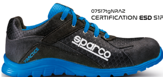
07517tgNRAZ CERTIFICATION ESD S1P