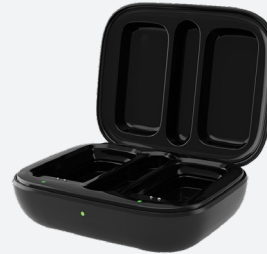
1 x Charging Case