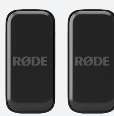
2 x Transmitters