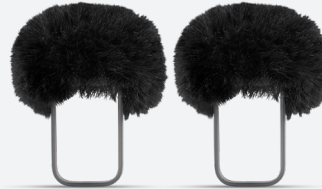
2 x Furry Windshields