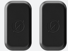
2 x Magnetic Attachments